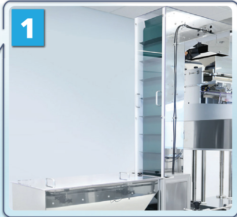
1 Floor Level Bulk Feed Hopper with Cleated Elevator Starts the Process