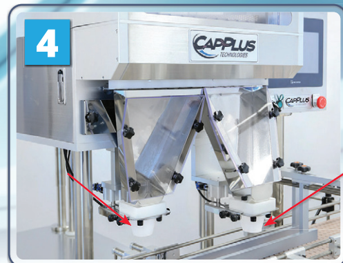
4 Flexible Silicone Funnels Finish the Process by Reducing the Incidence of Gummies Clogging the Funnels