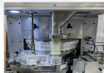
Mechanical Powder Feeder