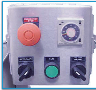
PLC Based Control Panel