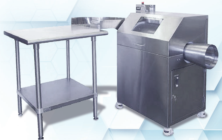
SG500 with Optional Infeed Table

Disposable non linting towels are attached to the stainless steel rings