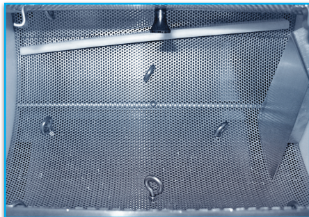
POLISHING DRUM • Inside View •

Automatically removes oil residue from softgel surfaces in preparation for capsule printing