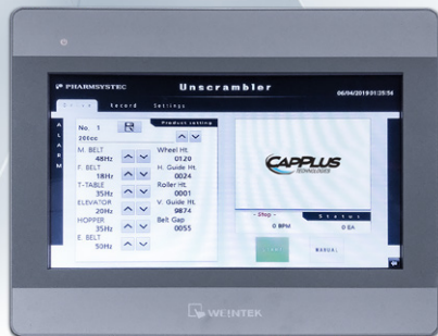
15" Windows Based Touch Screen Control Panel