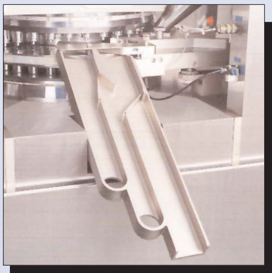
Ejection Chute Reject/Sample/Good